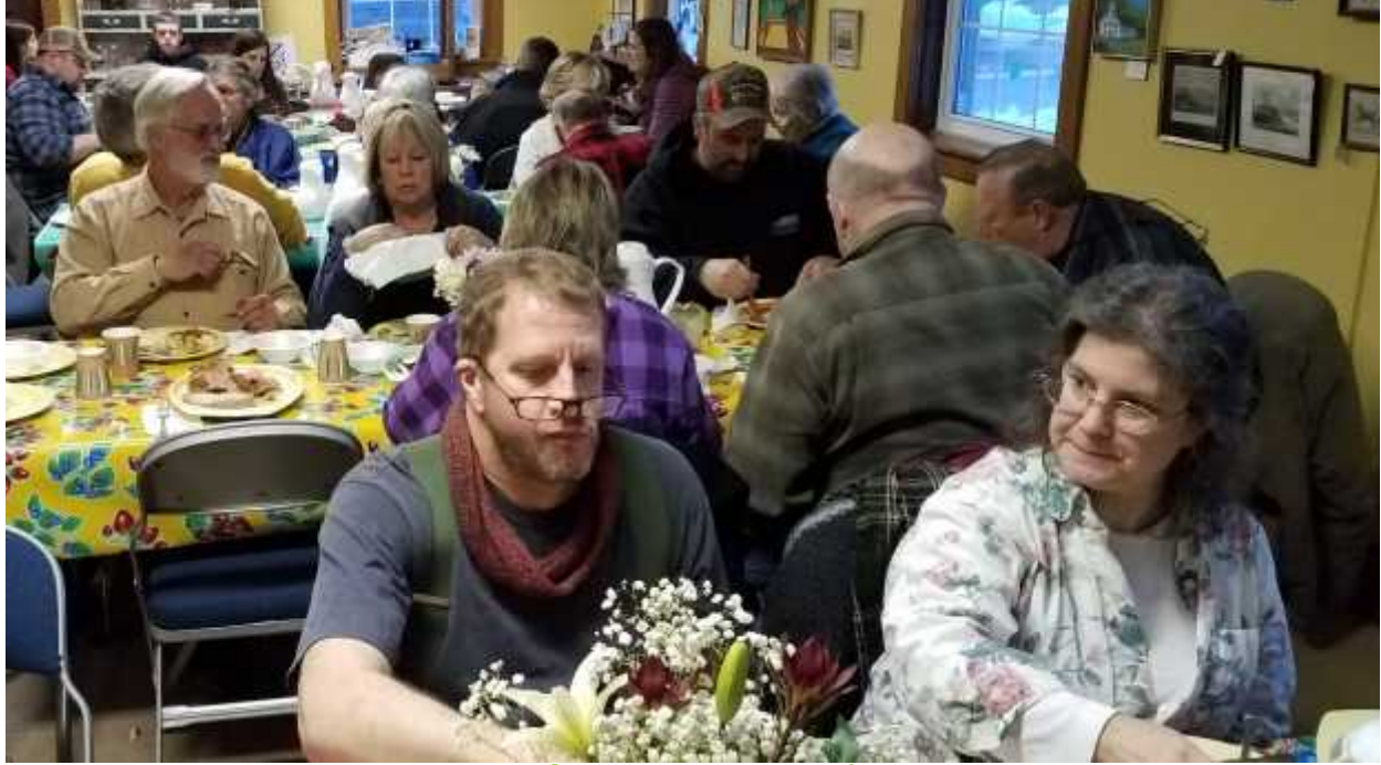
Diners from Colrain and Leyden enjoyed The Maple Supper at Town Hall