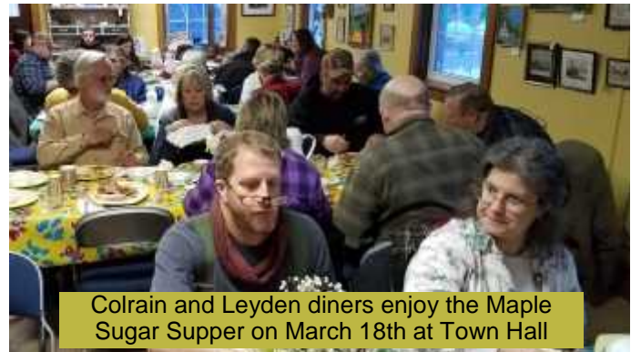
Colrain and Leyden diners enjoy the Maple Sugar Supper on March 18th at Town Hall

We hope there are no more snowstorms in our future, but just in case – when the schools are closed – no COA programs! —Cecelia Tusinski