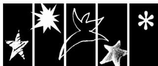
Massachusetts Cultural Council

This project is sponsored in part by a grant from the Leyden Local Cultural Council, a local agency that is supported by the Massachusetts Cultural Council, a state agency.