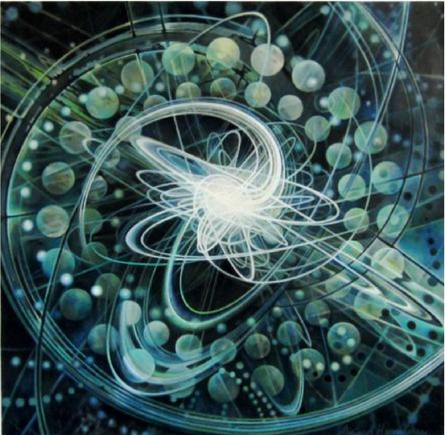
Convergence by Alicia Hunsicker, 2014 30" x 30", acrylic on paper mounted on cradle board