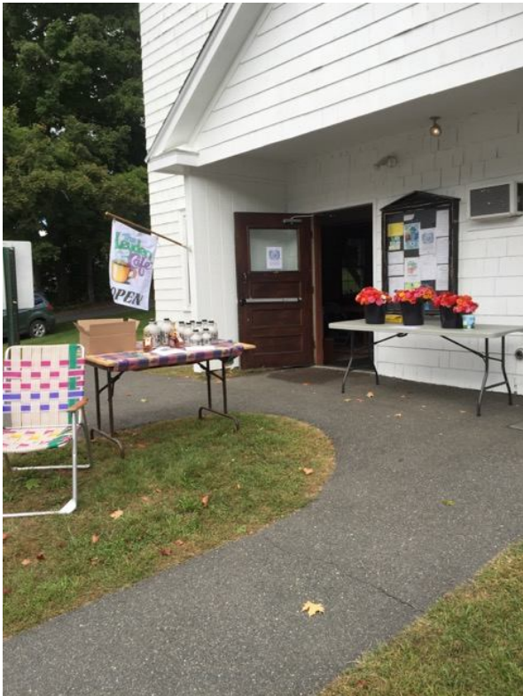
Preparing for Market Day