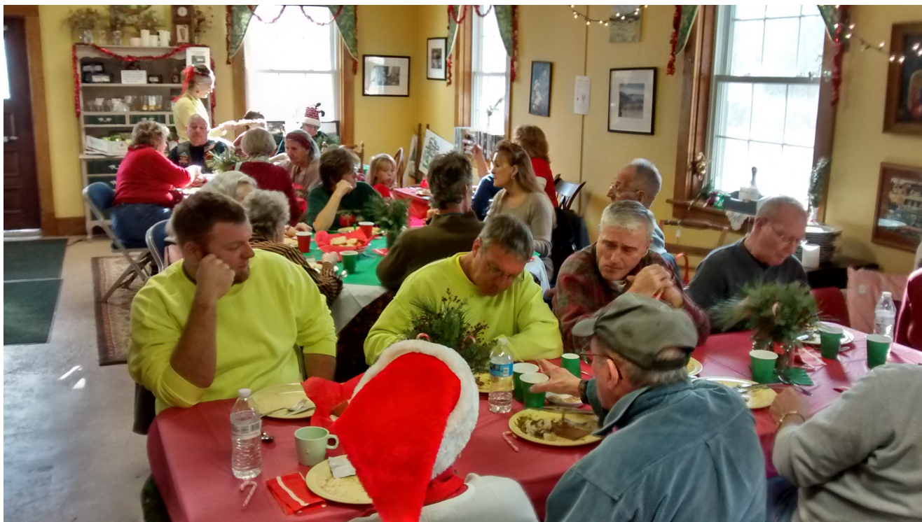
COA Holiday Luncheon at Town Hall On Wednesday, December 16 th