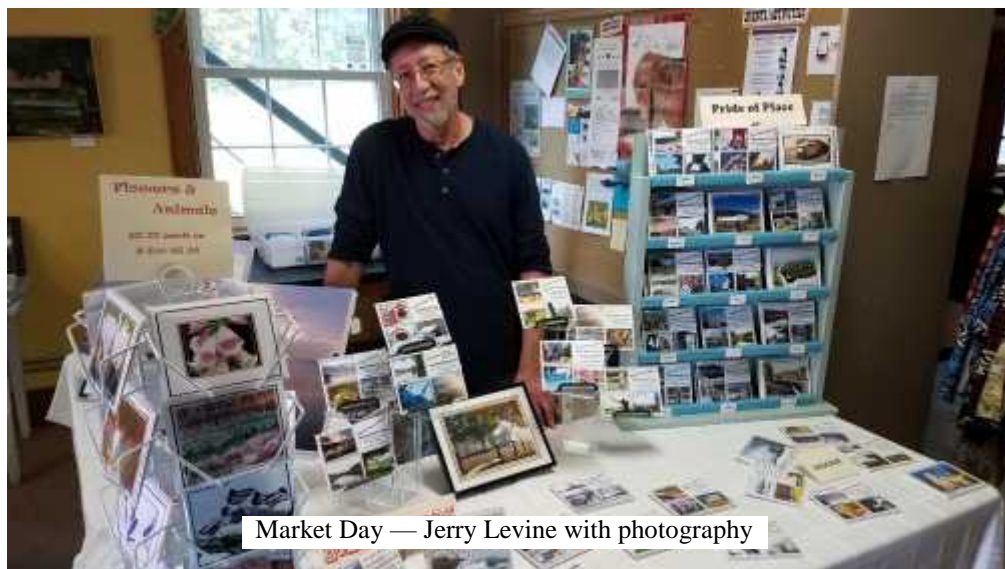
Market Day — Jerry Levine with photography