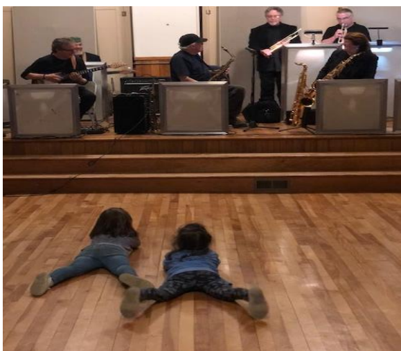
A good time was had by folks of all ages at the COA potluck and Charles Neville and the Skeletones!