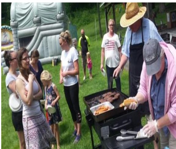
Huge Thanks to the Leyden Rec Committee and the PRES PTO for working together on the children's Olympics and Carnival! There was a great turn out and lots of fun!