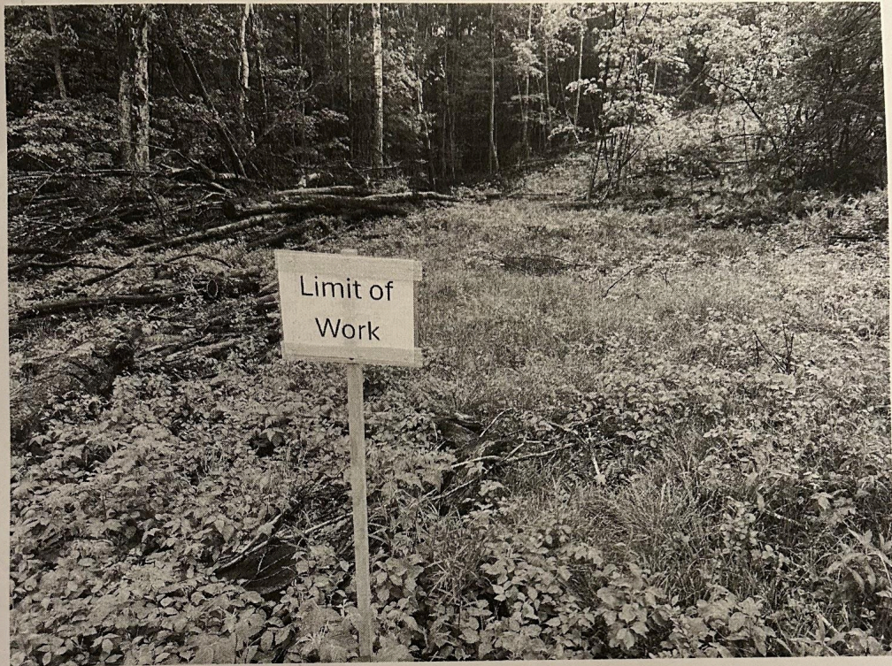
Photo 4. Limit of Work Sign