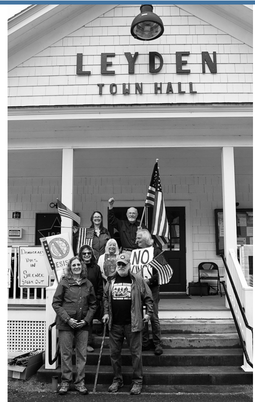
June 14, 2025. People who appeared in the NYT Magazine photo gathered for a retake!

"The antinuclear cause cuts across political lines. Last Spring, residents of the predominately Republican township of Leyden, MA, voted for a nuclear freeze."