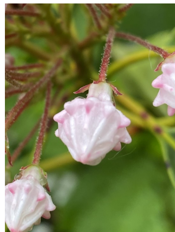
Mountain Laurel bud