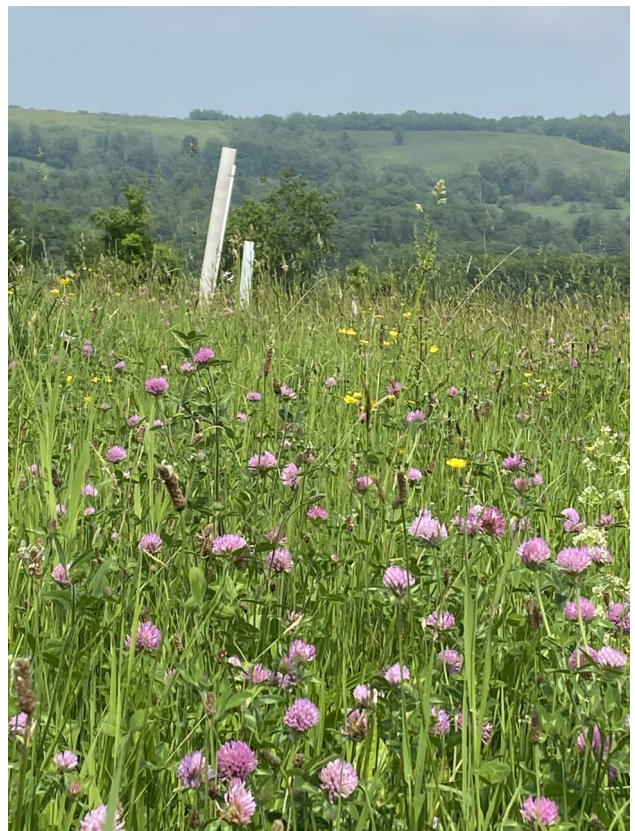
Photo taken from the top of Wilson Road