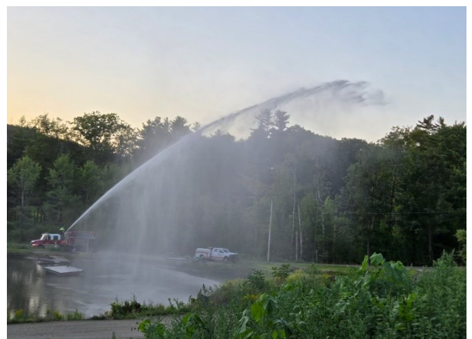
Pump training at the hydrant off Coates Road involved moving a lot of water.