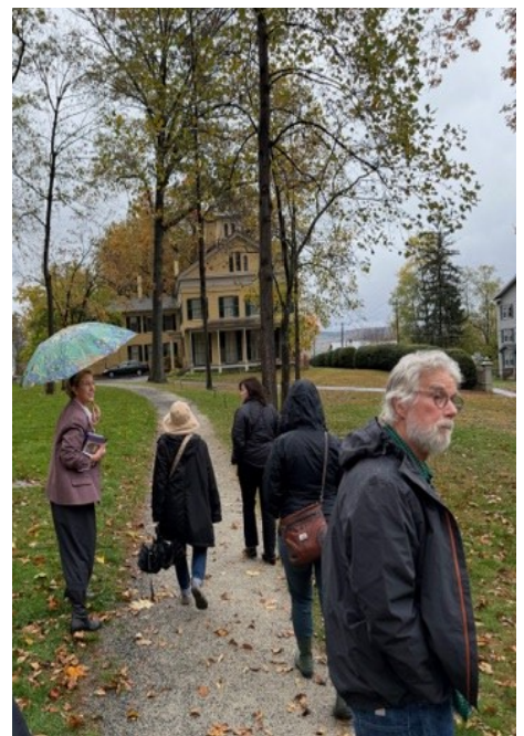
On October 20th, the Library book club visited the Emily Dickinson Museum.