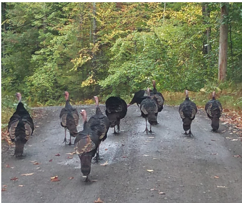
A Leyden traffic jam on Alexander Road.