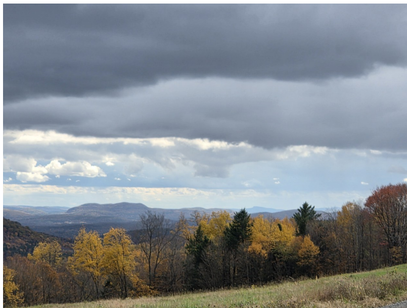
From Breezee Knoll Farm looking south.