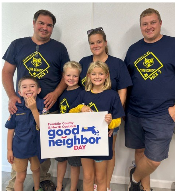
Our local Cub Scout pack came to the Heart of Leyden Festival during Good Neighbors Day.